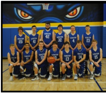
Boys basketball plays Tea Area Titans. Girls played the Titans last night.